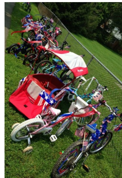
A Beautiful Day in the Neighborhood. WWCA neighbors and friends enjoy the activities at the 4th of July Picnic.